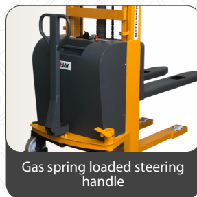
Gas spring loaded steering handle