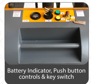
Battery Indicator, Push button controls & key switch