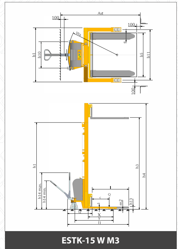
ESTK-15 W M3

* This specification sheet only provides technical values for the standard equipment only. Customised equipments, Non-standard tyres, different masts, additional equipment, use of accessories, etc. may produce other values