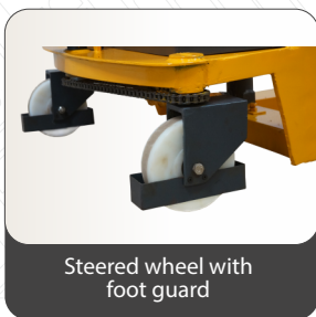
Steered wheel with foot guard